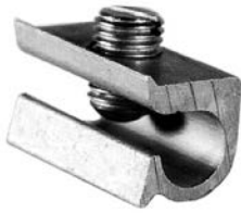
K1190 (For factory installed triplex ground add suffix "-TG" to the catalog number.)