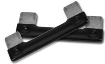
K8180 (Bypass links are sold in pairs)