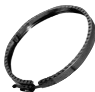
BUCKLE HASP MR-8