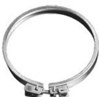
SCREW TYPE MR-4