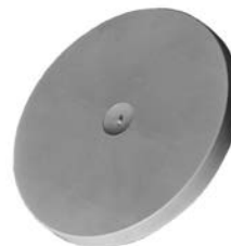
METER CLOSING PLATE (Gray Plastic) 6003