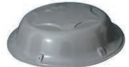
ABS Cicolac® Grey