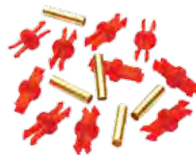
USPTH Pin-Tie Accessory