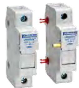
USM1 with USPTH Pin-Ties