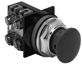
1 3/8" Mushroom Head