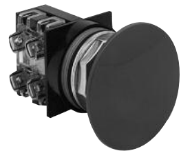
2 3/8" Mushroom Head