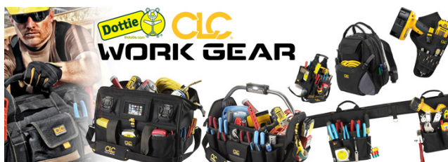
Showroom Banner 17" x 48"