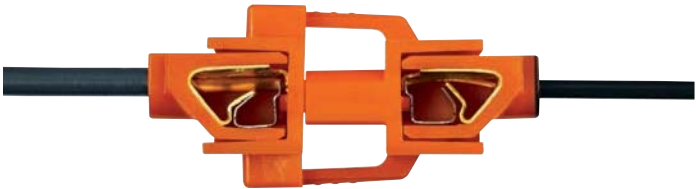
This cutaway shows how the Sta-Kon® Luminaire Disconnect grips and holds the pushed-in wires securely after installation