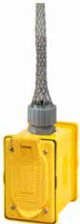
Deluxe Cord Grips (purchased separately)