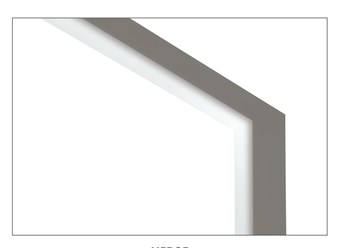
MERGE shown flangeless

Notes: Typical max run length is 40' for the low-voltage bus which can be powered from both sides for a total of 80'; system wattage will impact max run length