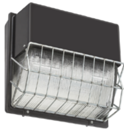
WG - Wire guard