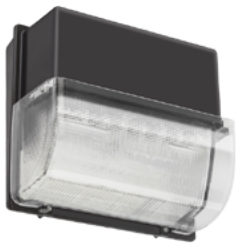
VG - Vandal guard