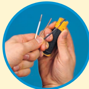
Strips wire carriers.