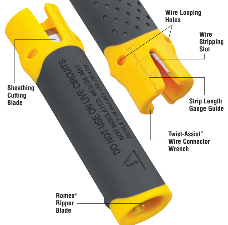
Wire Looping Holes