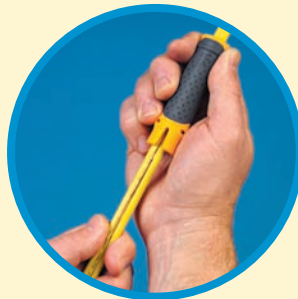
Rapidly rips Romex® Sheathing.