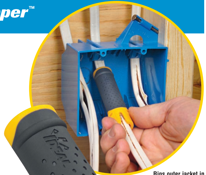
Rips outer jacket in hard to reach areas