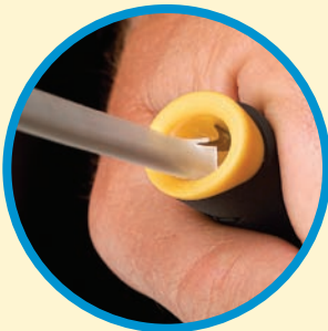
Insert Romex® into specially designed blade.