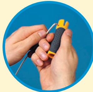
Loops wires for screw connections.