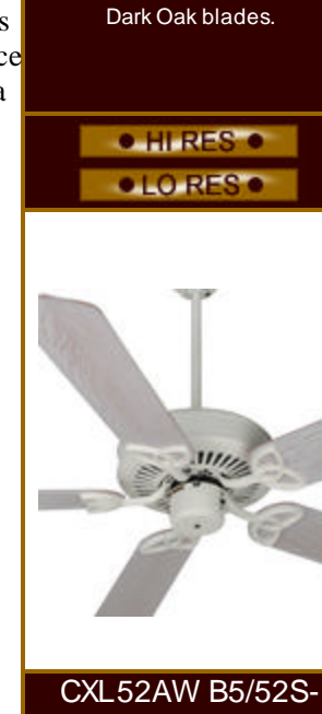
BW10 Antique White finish with Custon