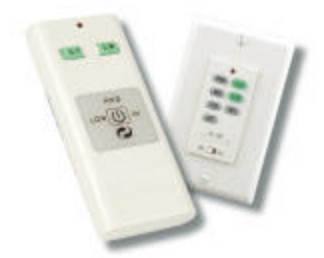
TCS and TCS+ Controls Available

Note: Fans and Blades are Sold Separately. Page 1, 2, 3, 4, 5