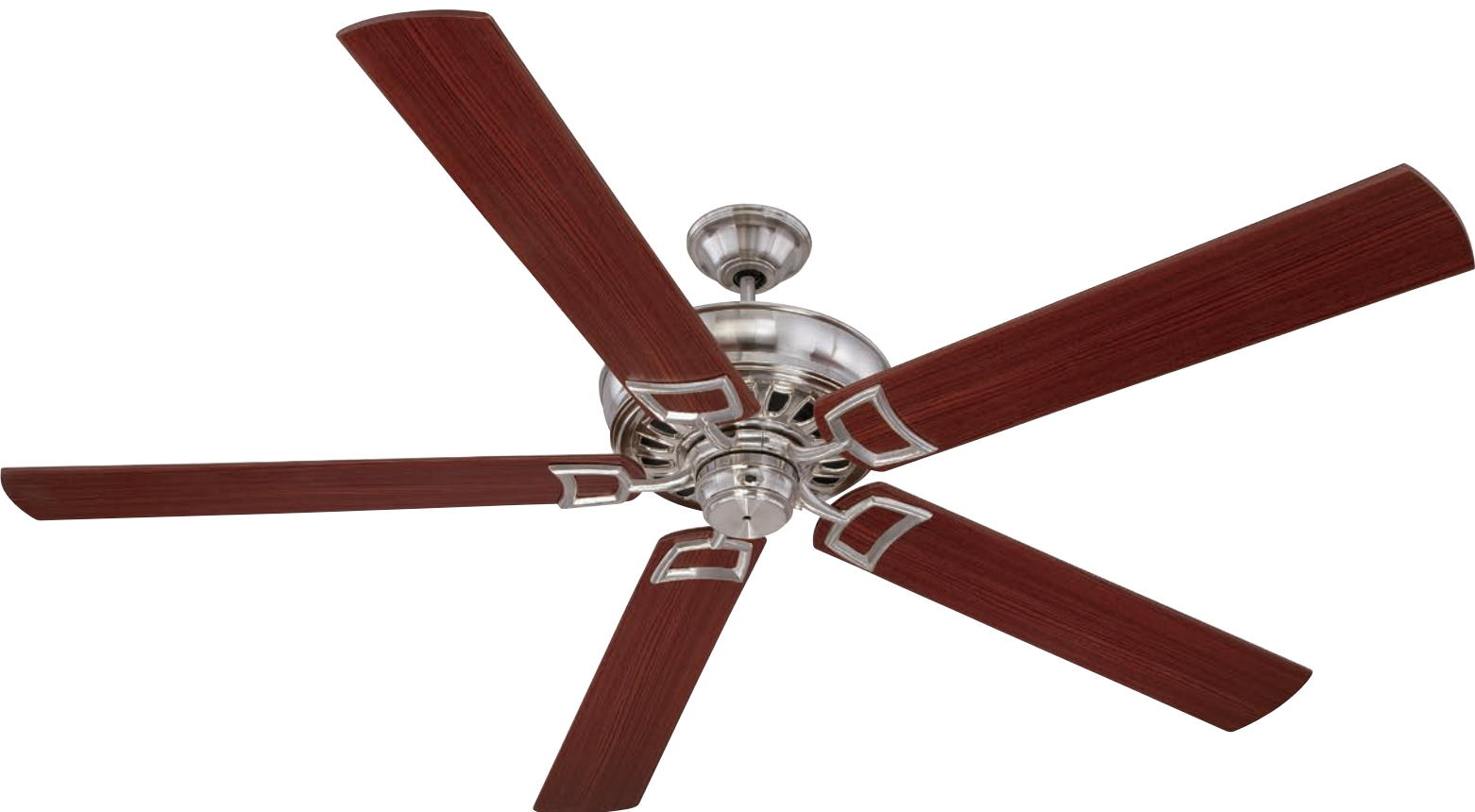
Stainless Steel Rutgers with 72" Reversible Walnut/Sable Blades Model . . . RU72SS5 Blade . . . Included Light. . . . Not Shown