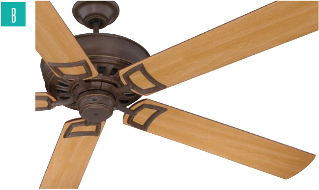
A Oiled Bronze Gilded Rutgers with 72" Reversible Walnut/Cherry Blades

Model-Finish RU72OBG5 Blade-Finish Included Light-Finish Not Shown