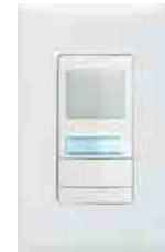
nWSX LV NL nWSX PDT LV NL