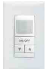
nWSX LV DX nWSX PDT LV DX