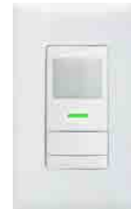
nWSX LV nWSX PDT LV