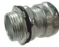
Uninsulated Connectors Steel