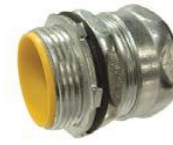
Insulated Connectors Steel