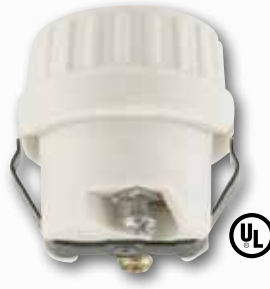
* 22276 Snap-In Porcelain Socket 660 Watts Max., 250 Volts Height - 1 3/4"