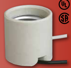
* 22218 Keyless Socket 1 Screw Surface Mount Medium Base 7" Wire Leads 660 Watts Max., 250 Volts 105° Leads Leads Height - 1 5/8"