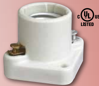
* 22273 One-Piece Receptacle Medium Base 600 Watts Max., 250 Volts Height - 1 1/2" 180° C Maximum Temp.