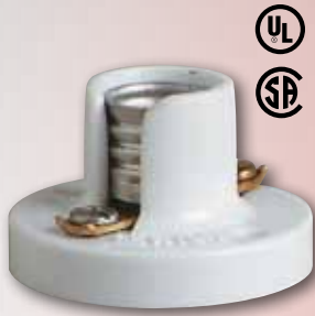
* 22264 Receptacle Candelabra Base 75 Watts Max., 125 Volts Height - 7/8"