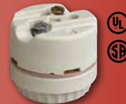
* 22266 70423 Two-Piece Sign Receptacle Medium Base 660 Watts Max., 250 Volts Height - 1 1/2" 300° C Maximum Temp.