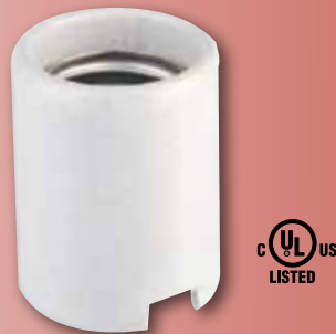
* 22282 Mogul Base Socket 1500 Watts Max., 600 Volts Height - 2 5/8" 4KV Pulse Rating