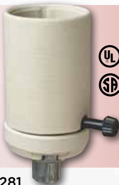
* 22281 Mogul Base Socket 3-Way Removable Knob Bushing 1/4-IP 750 Watts Max., 250 Volts Height - 4 1/4"