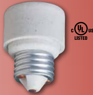
* 22150 70364 Socket Extender Medium Base 660 Watts Max., 250 Volts Extension - 1/4" Overall Length - 2 1/4"