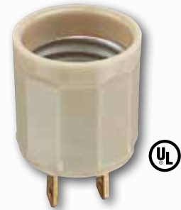
* 22739 Phenolic Adapter Ivory Socket Medium Base Polarized 660 Watts Max. 15A, 125 Volts