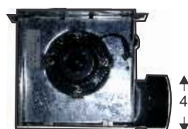
Housing & motor