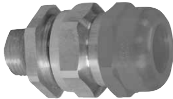
Dimensions in Millimeters (Inches)