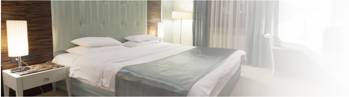
Application illustration only, subject lamps not used in photo.