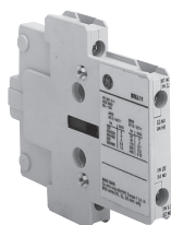
Side-Mount 600V Auxiliary Contact Block