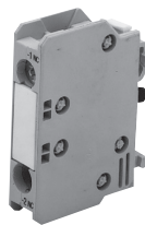
Front-Mount 600V Auxiliary Contact Block