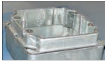
RETRACTED (3/4" Raised)