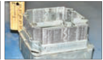
EXTENDED (1-1/2" Raised)