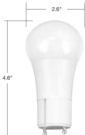
10W Omni-Directional A-Lamp