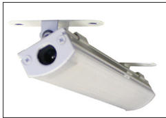
Adjustable angle mounting clip (SL-C3-WT)