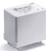
56T Series Miniature power relays