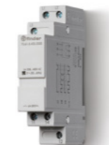
70T Series Line monitoring relays