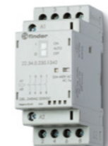
22 Series Modular contactors