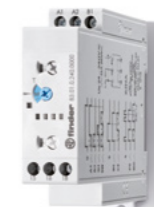
83 Series Modular timers