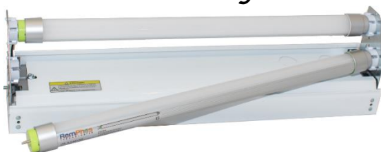
High Performance RemPhos LED T8 Tubes (4ft = DLC)