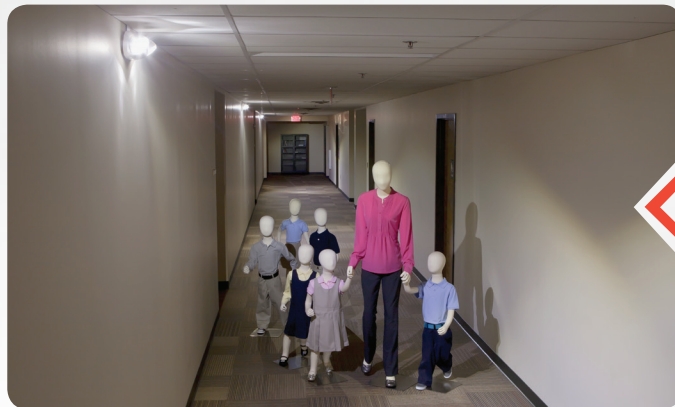
Quantum® ELMLT unit at one and 90 minutes