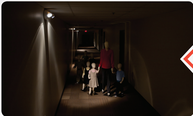
Typical unit at 90 minutes