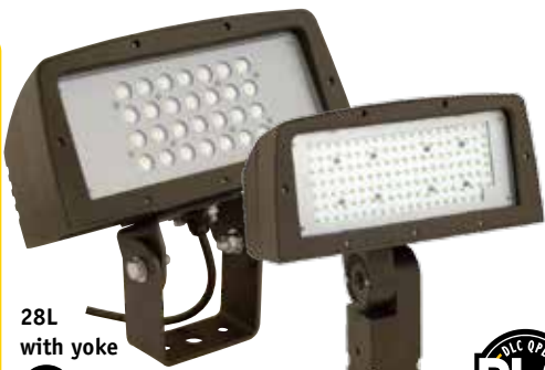
28L with yoke