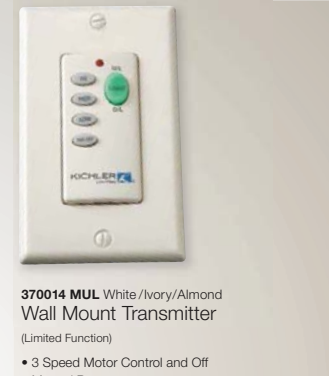
370014 MUL White/Ivory/Almond Wall Mount Transmitter (Limited Function)