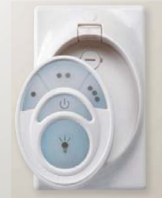
337214 (Standard White Finish) Universal CoolTouch™ Control System CoolTouch™ Control Systems: Looks permanent, but goes wherever you go!