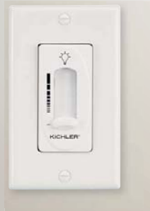
337011 WH White 337011 IV Ivory 337011 ALM Almond Light Dimmer Slide Control