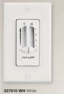
337010 WH White 337010 IV Ivory 337010 ALM Almond Fan/Light Dual Slider Control