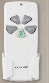
337001 WH White Basic Hand Held Control System

See Control Systems Compatibility Guide for correct controller.