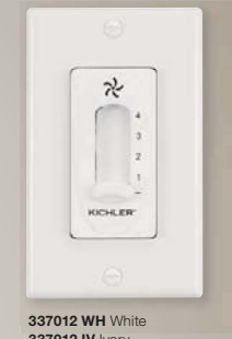
337012 WH White 337012 IV Ivory 337012 ALM Almond 4 Speed Fan Slide Control