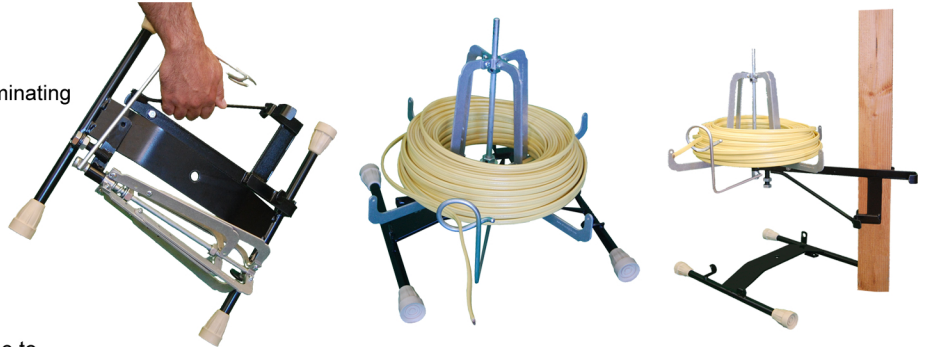
19CFS20 - 20" Combination Stud Reel 19CFS25 - 25.5" Combination Stud Reel