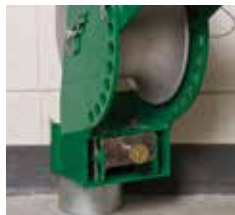
Connect at floor height