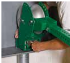
Connect for an upward pull