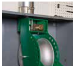
Connect for an downward pull