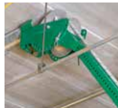
Optional 12' boom extension for high pulls