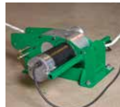
Optional floor mount