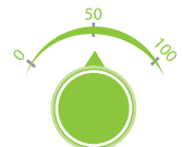
Task Tuning & Personal Control