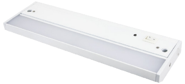
LED 3-Complete - White