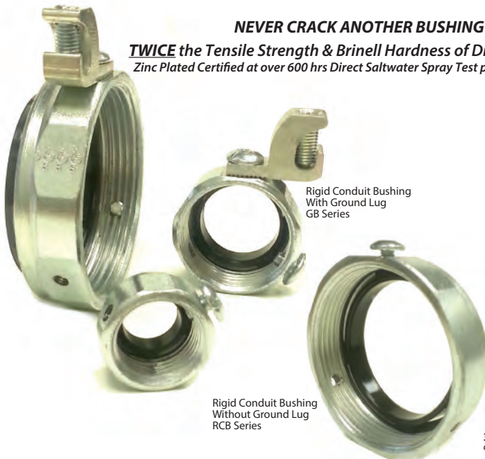
Rigid Conduit Bushing With Ground Lug GB Series

TWICE the Tensile Strength & Brinell Hardness of Die Cast Products Zinc Plated Certified at over 600 hrs Direct Saltwater Spray Test per UL 514.b 5.1.3.3