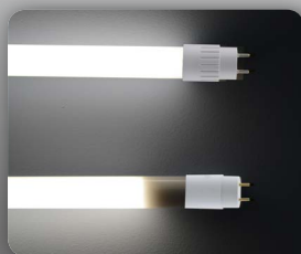
Other LED Tubes