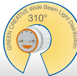
Lamp Front View

This lamp uses an innovative glass design that diffuses heat and light more evenly. As a result of its compact light engine, this lamp produces a light emitting area of 310°. This wider beam angle improves a fixture's total light distribution and creates a more complete lighting effect.