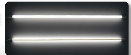
Lamp Back View