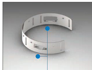
Torsion Spring Receivers