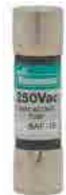
250Vac 1/4 to 30A