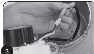
3 Attach LED module (RL56 or ML56).