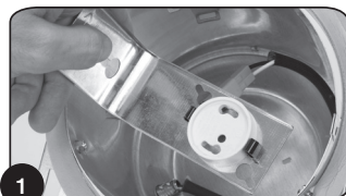
1 Remove socket bracket.