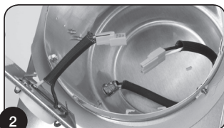
2 Unplug GU24 socket from connector.