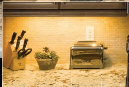
Warm White Colour Temperature: 2700K