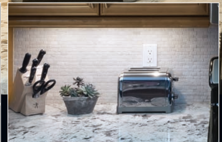
Cool White Colour Temperature: 4000K