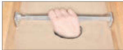
2) Twist out to bite on joists.