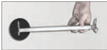
1) Cut hole & insert bracket.