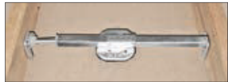
3) Install box.