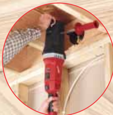
Hole drilling for HVAC venting