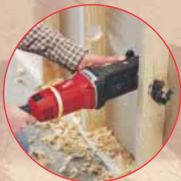
Hole drilling for piping runs