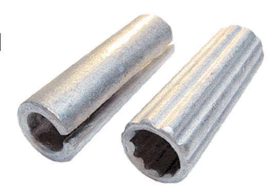
Copper wire only