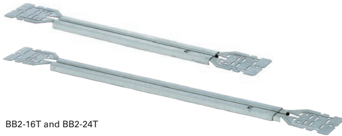
BB2-16T and BB2-24T