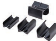
BB2TCT series copper pipe insulator sleeve