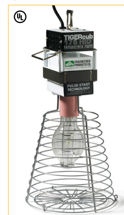
TIGERcub 175 HID