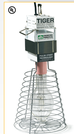
TIGER 400 HID