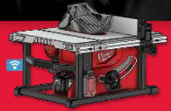
8-1/4" Table Saw w/ ONE-KEY™