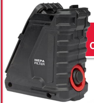
TABLE 1 COMPLIANT