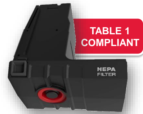
TABLE 1 COMPLIANT