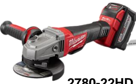
2780-22HD 2781-22HD 2783-22HD