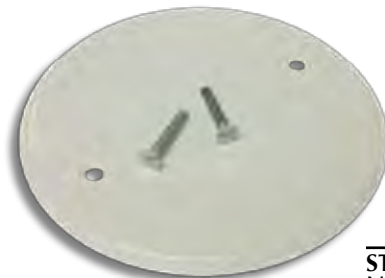
PACKAGED 10 IN POLY BAG