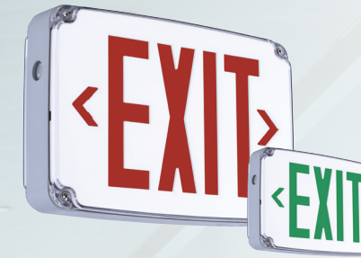
CEW Wet Location Exit