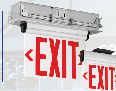
CEL Edge-Lit Exit