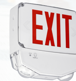
CWC Wet Location Exit/Emergency Light