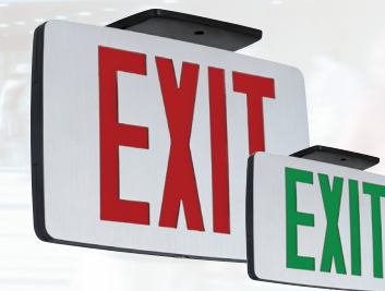
CCE Thin Die-Cast Exit