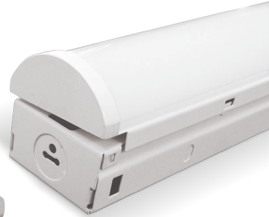
Side View With Removable Designer Cover