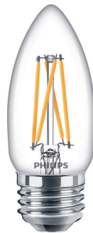
Single Contact Medium Screw B 35mm Clear