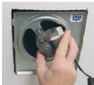
Snap in new motor to housing.