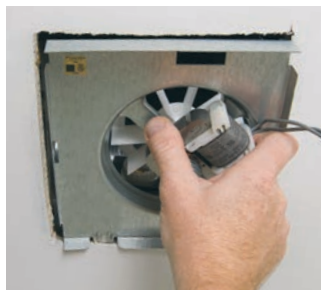
Remove old grille, unplug and remove motor.