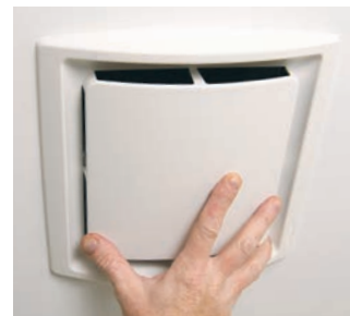
Attach grille springs to fan and push grille up against the ceiling.