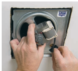
Plug motor into existing receptacle.