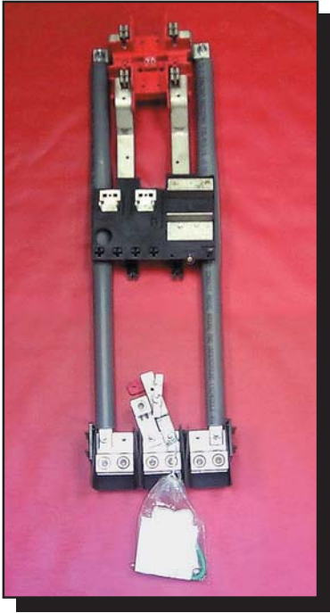
Catalog # 020-148-00-00-0 MPAP 200A interior rebuild kit