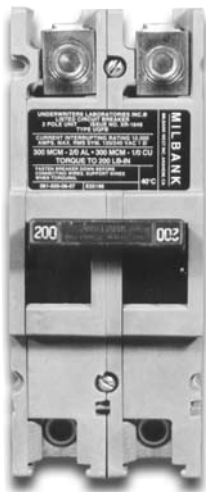
Catalog # UQFB-(###) * Replacement bolt-on circuit breaker for old style pedestals