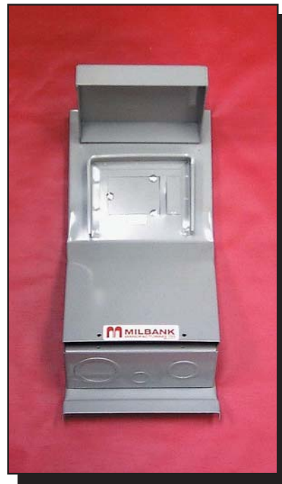
Catalog # SF-BL Sloped front connection kit with KOs for Unicorn MPP pedestals. Circuit breaker not included. Replacement circuit breaker for kit is plug-on # UQFP-100/200 .