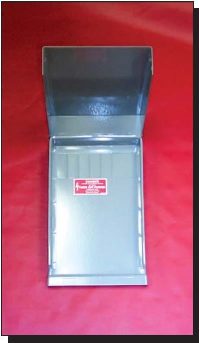
Catalog # PF-BL MPAP / MPRV blank deadfront with hinged cover