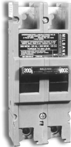
Catalog # UQFB-(###)-X * Replacement bolt-on circuit breaker for old style pedestals