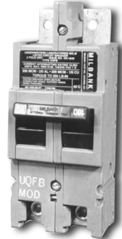
Catalog # UQFB-(###)-X-MOD * Replacement bolt-on circuit breaker for old style Unicorn MPMH & MPB pedestals