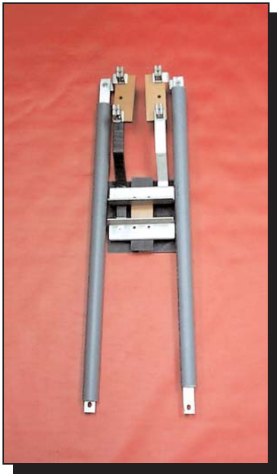
Catalog # RBK-1 Unicorn MPP (pre-1969) interior rebuild kit