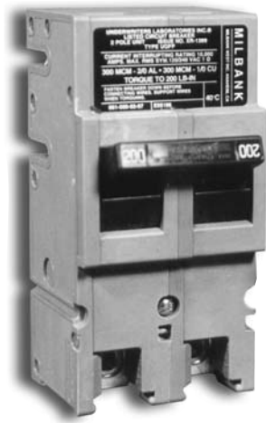
Catalog # UQFP-(###) * Replacement plug-on circuit breaker for MPAP & TPAP pedestals. For parallel main circuit breaker.