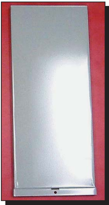
Lug cover for MPAP / MPRV Order Catalog # 403456-SC (8½" W x 20½" H) for 72" pedestals and Cat. # 403457-SC (8½" W x 26½" H) for 78" pedestals.