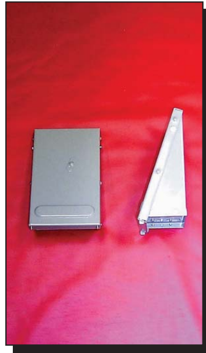
Catalog # PF-KR MPAP / MPRV rear connector kit