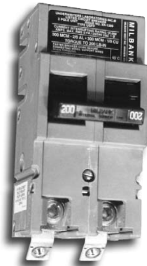
Catalog # UQFP-M-(###) * Replacement plug-on circuit breaker for MPAP & TPAP pedestals. For series main circuit breaker.