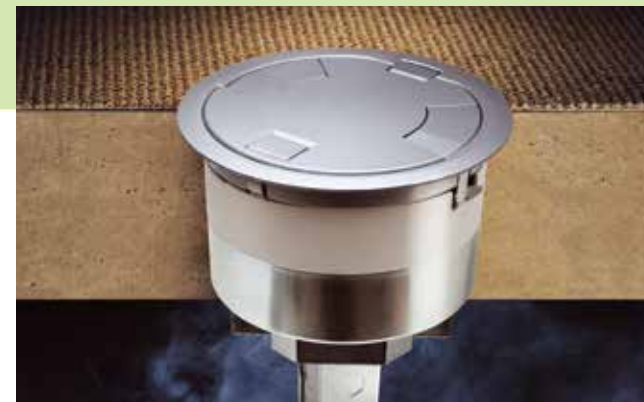
Two-Hour Fire Rating – Uses an intumescent material that maintains the fire rating of any floor for up to two hours.