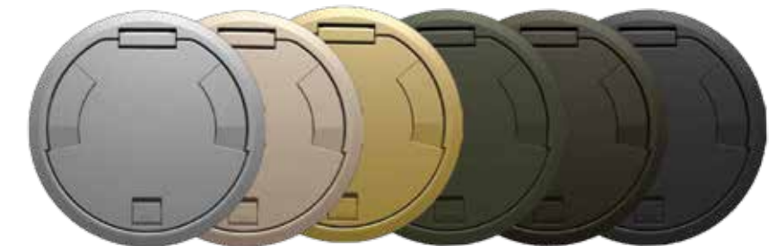
Aluminum Nickel Brass Gray Bronze Black

All features are standard in our 6", 8" and 10" cover sizes.