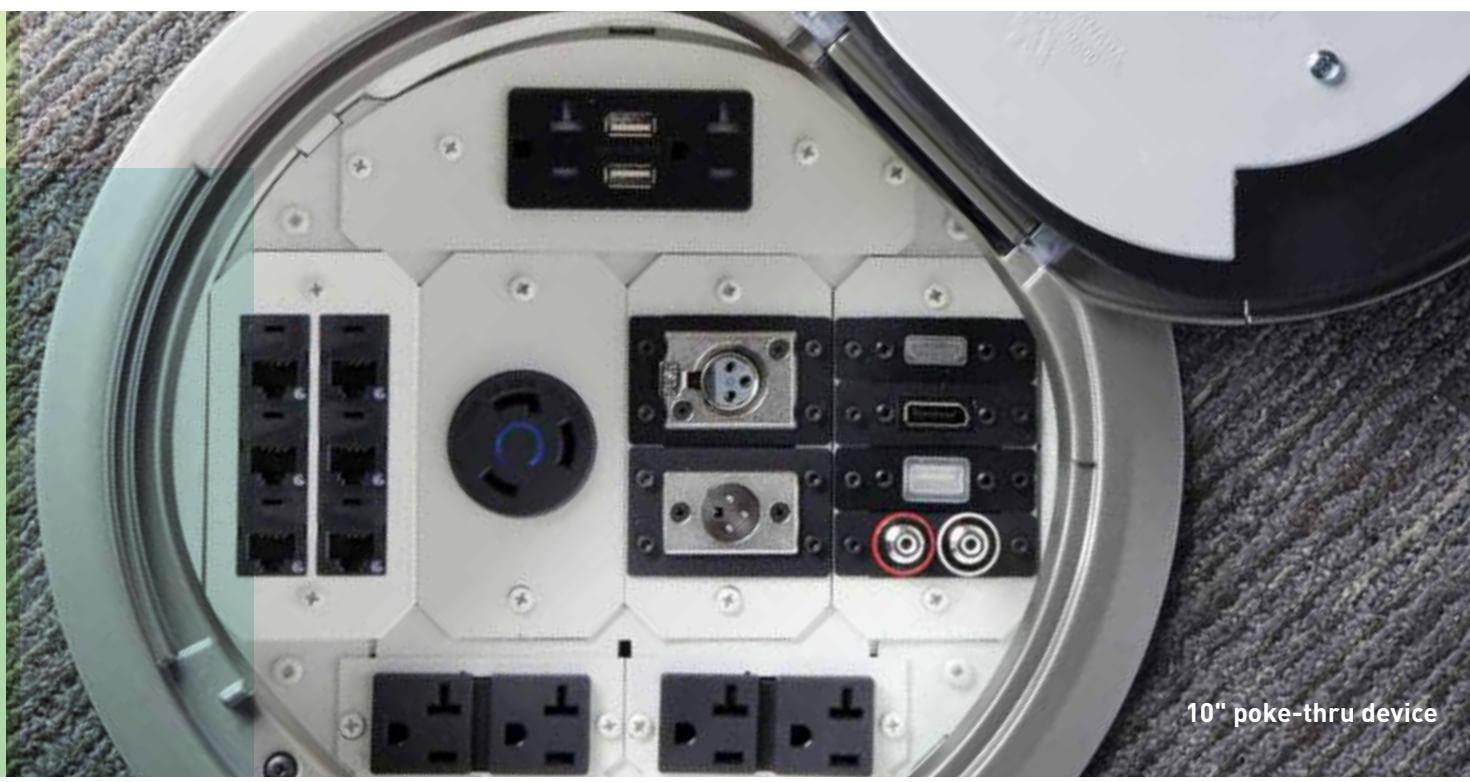
10" poke-thru device

AN INDUSTRY FIRST: 8-gangs of capacity in the largest poke-thru ever