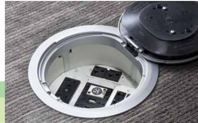
Recessed Devices Provide Maximum Protection – All power, communications and A/V devices are recessed below floor level, providing device longevity.