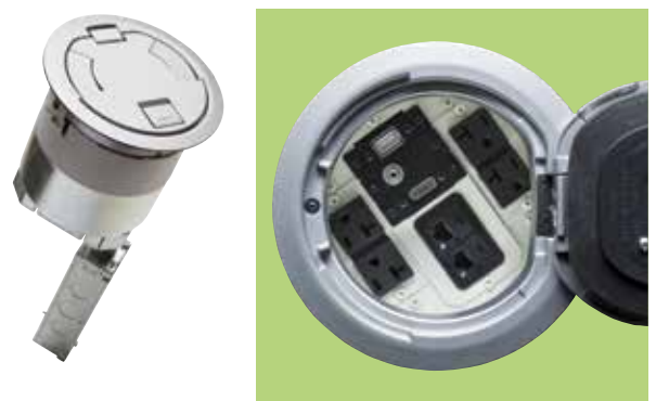
3-gangs of capacity