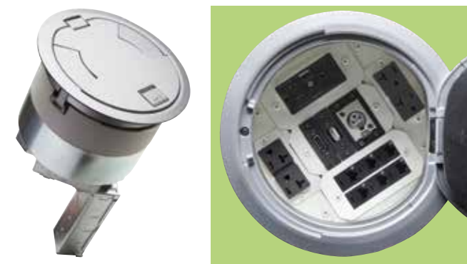
5-gangs of capacity

Configure an Evolution Poke-Thru Device to fit your needs: www.legrand.us/evolution .