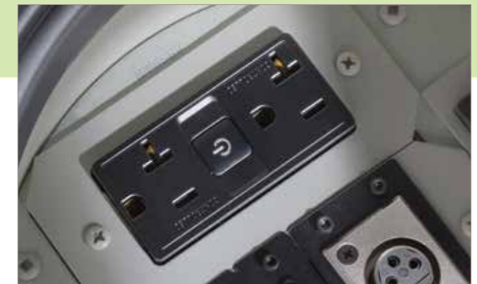
Plug Load Control up to 30 Feet – Tested with Pass & Seymour® Wireless RF receptacles to control plug loads up to a distance of 30 feet when the cover is closed.