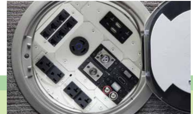
Open System for Expanded Compatibility – Accepts industry standard power, communications and A/V devices from most manufacturers including Legrand AVIP, Extron® and more.